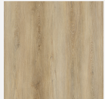
MONTE VALLEY - CG9MV