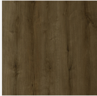
PUERTO TRUJILLO - CG7PT