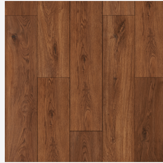
LA SALTA - CG7LS