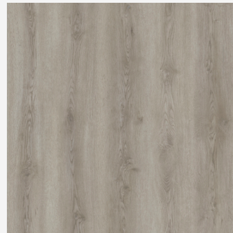
EL CAMINO - CG9EC