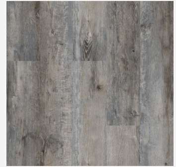
MOUNTAIN MIST - CG7MM