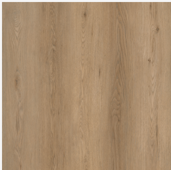
SANTA LUCIA - CG7SL