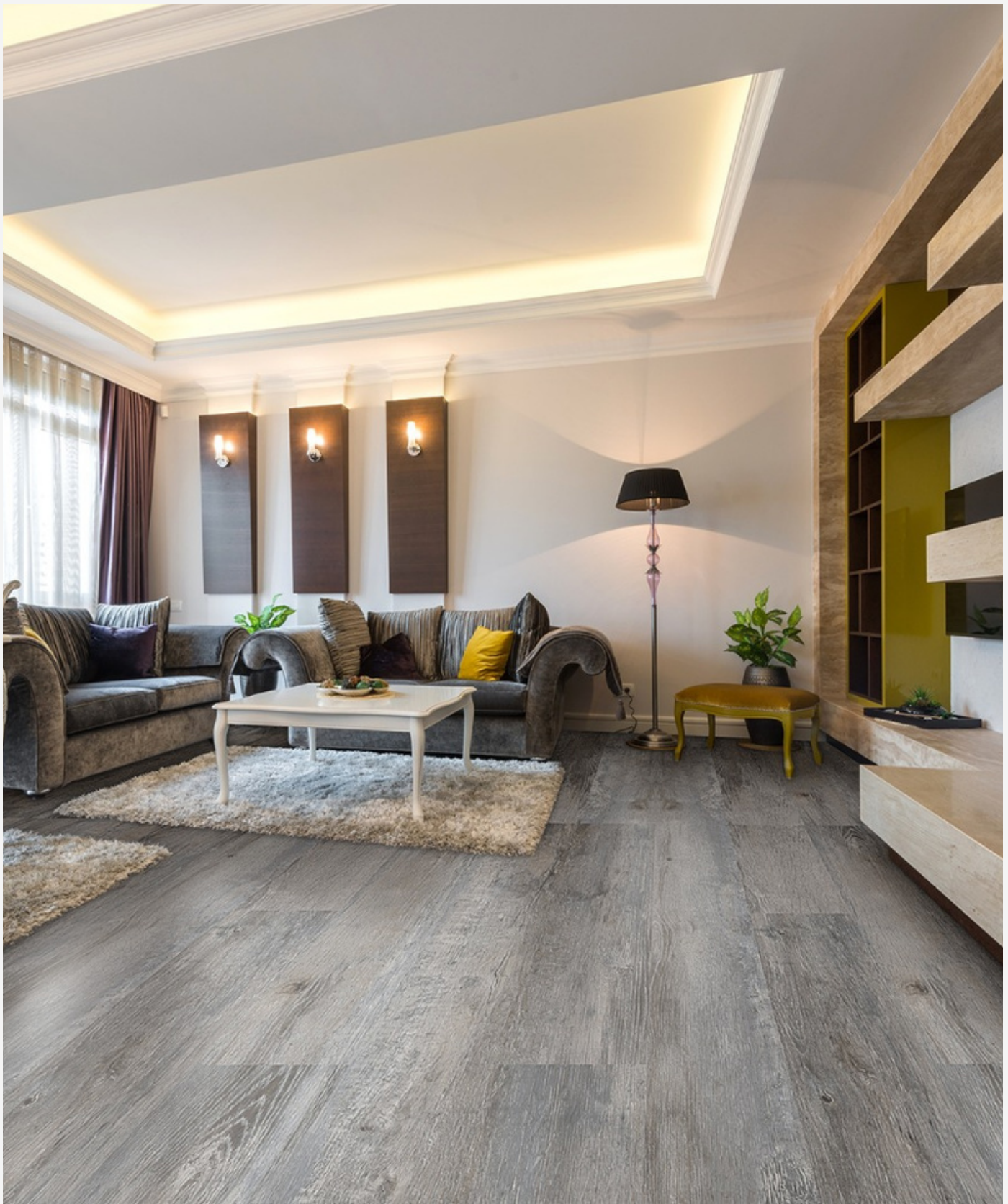
Mountain Mist - CG7MM