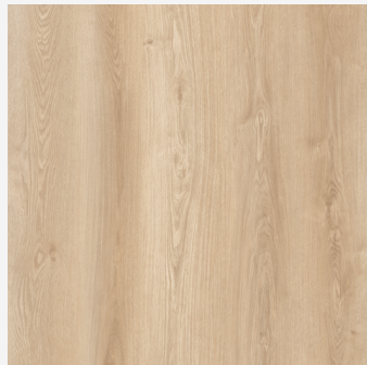
CERRO BLANCO - CG7CB