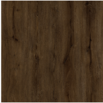
SAO ALTO - CG7SA